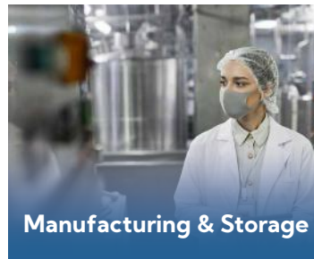
Manufacturing & Storage