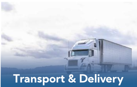
Transport & Delivery

Audit temperature-controlled spaces from food safety to vaccines storage and never throw away expensive inventory again.