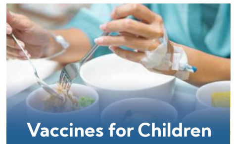
Vaccines for Children