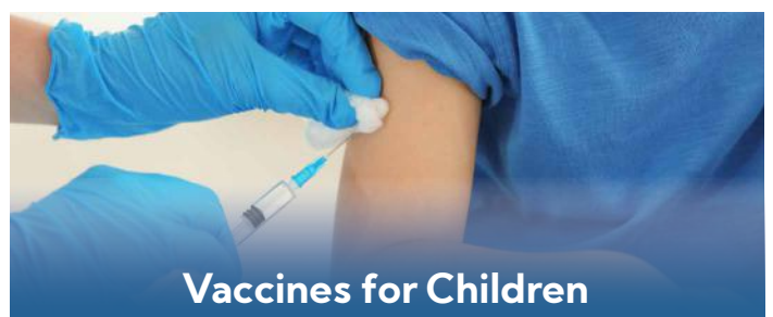
Vaccines for Children